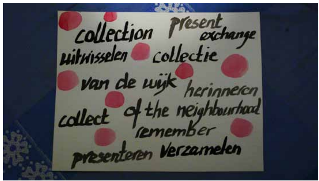
Plan V Mapping