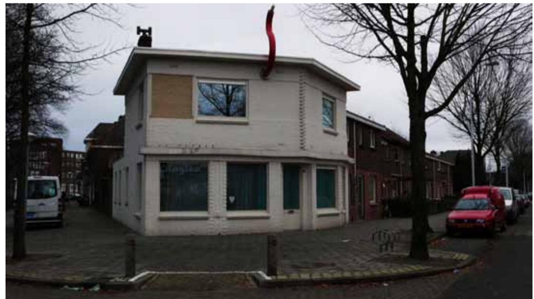
Collectie van de Wijk on Edisonstraat