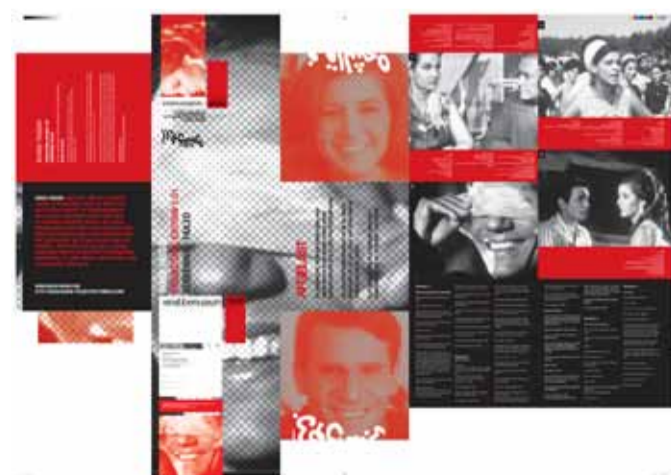
Forthcoming artist's book: INASS YASSIN Projection Edition 1.01, Screening Failed, 2010 Design: Brooklyn. With special CD and poster.