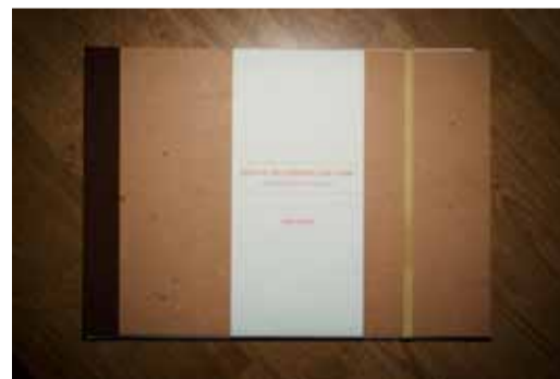
JUUL SADÉE Book of the Gardener's Last Song: Particles, Patterns, Passions, 2010 Design: Carli Hyland; Printer: Digitale Drukker Eindhoven. With Topological mindmap by Joost Bolten (EN/NL)