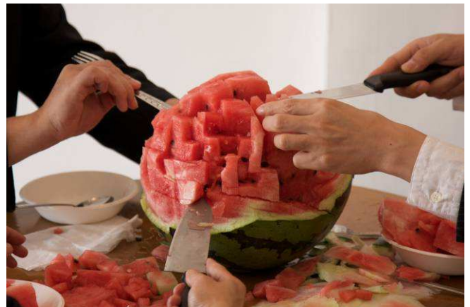
Xijing Men, I Love Xijing , 2009, performance. The Urban Planning of Xijing . Courtesy of the artists

Same performance as performed on 29 th of April.