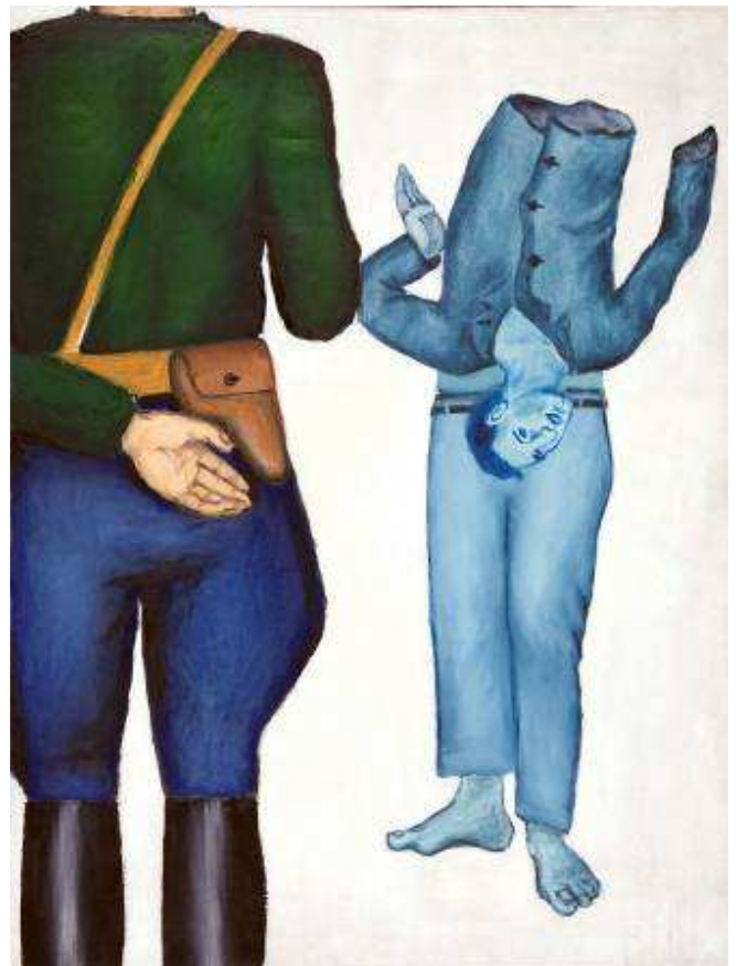
Andrzej Wróblewski, Execution VI with Gestapo Man , 1949, private collection.