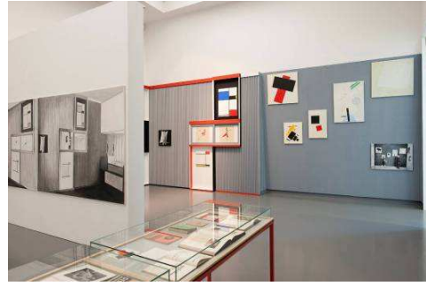
Abstraktes Kabinett, 1927 Ontworpen door / designed by Alexander Dorner en / and El Lissitzky Geïnterpreteerd door / interpreted by Museum of American Art Berlin. Zaaloverzicht / Installation view Van Abbemuseum, 2010.