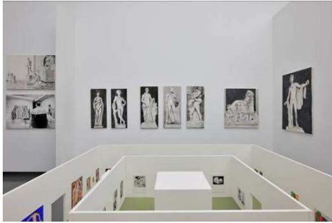
Museum of Modern Art New York (MOMA), 1929 Samengesteld door / curated by Alfred H. Barr Jr. Geïnterpreteerd door / interpreted by Museum of American Art Berlin Zaaloverzicht / Installation view Van Abbemuseum, 2010.