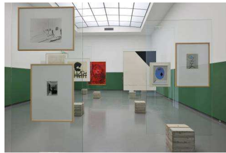
Museu de Arte de São Paulo (MASP), 1968 Ontworpen door / designed by Lina Bo Bardi Geïnterpreteerd door / interpreted by Wendelien van Oldenborgh Zaaloverzicht / Installation view Van Abbemuseum, 2010.